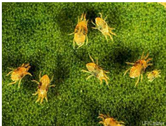
UF/Castner Two spotted spider mites

Insects, particularly the two spotted spider mite, may be more of a problem in a dry year in soybeans than in a year with normal precipitation. Use the following link for more information on two spotted spider mites. https://extension.umn.edu/soybean-pest-management/twospotted-spider-mites-soybean#:~:text=Twospotted%20spider%20mites%20feed%20on,of%20leaves%20(Figure%202) . Be careful spraying for spider mites as premature spraying may cause soybean aphid populations to spike because the beneficial insects that keep aphids in check are killed by the insecticide applied to control the spider mites. Use the established thresholds outlined in the link above to make decisions on spraying spider mites or not.