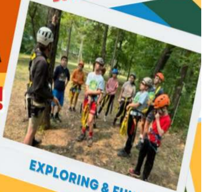
EXPLORING & FUN!