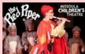
January 11 Sheldon Theatre