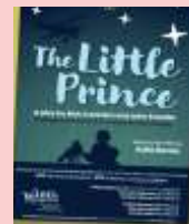
February 21-23 & 28-2 Menomonie Theater Guild