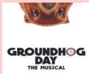
Groundhogs Day May 1 JAMF Theatre