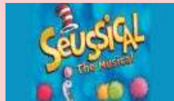
Seussical the Musical June 26 & 27 RCU Theatre