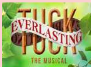
Tuck Everlasting April 3 - 6 JAMF Theatre

Here are some suggestions we found but you are not limited to these: