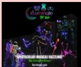
Illuminate April 10 RCU Theatre