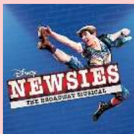
Newsies June 13-15 Pablo Center

Here are some suggestions we found but you are not limited to these: