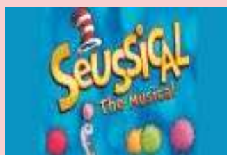
Seussical the Musical June 26 & 27 RCU Theatre