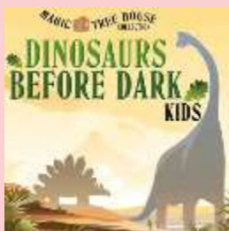
Dinosaurs Before Dark June 19 & 20 The Oxford