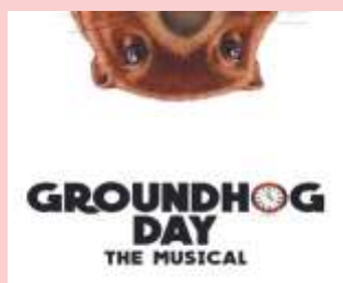
Groundhogs Day May 1–3 JAMF Theatre

Here are some suggestions we found but you are not limited to these: