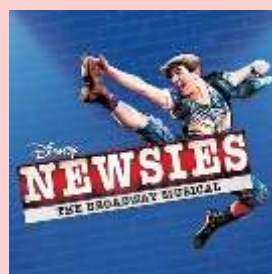
Newsies June 13-15 Pablo Center