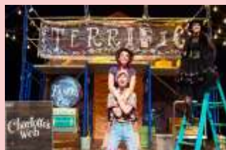
Charlotte's Web May 7 Sheldon Theatre