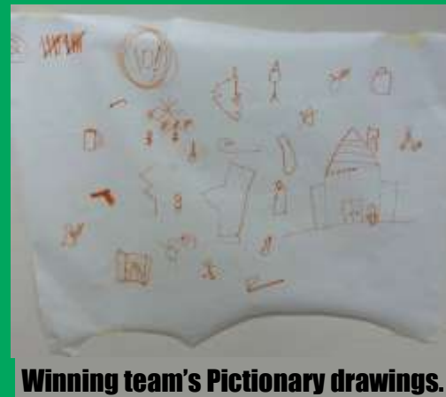
Winning team's Pictionary drawings.